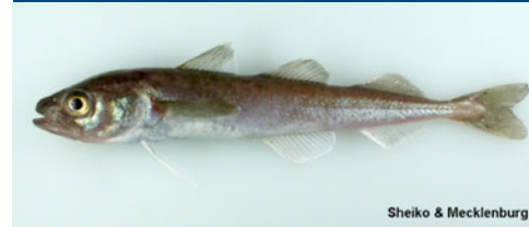
Arctic Cod: Boreogadus saida (a pelagic cod adapted to close association with ice (cryopelagic))

together experts from around the circumpolar North to share knowledge about B. saida and A. glacialis , synthesize what we currently know, and plant the seed for future comparative.