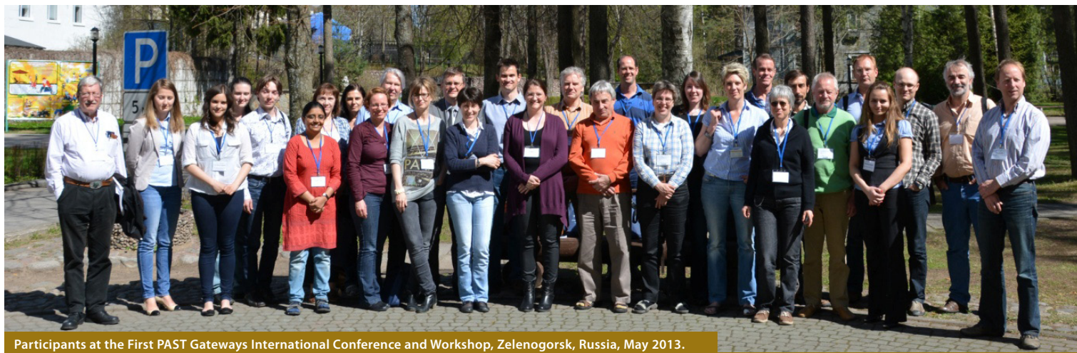
Participants at the First PAST Gateways International Conference and Workshop, Zelenogorsk, Russia, May 2013.